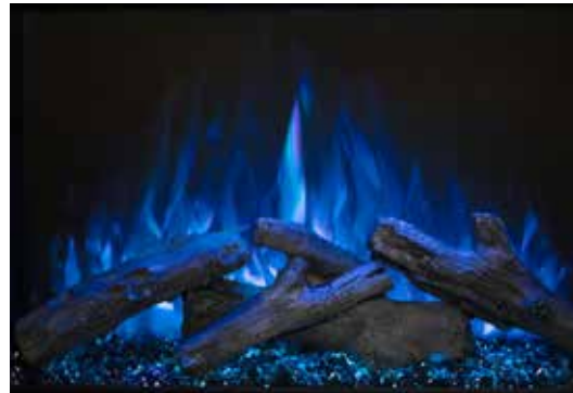
Blue Flames - Logs off