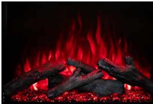
Red Flames - Logs off