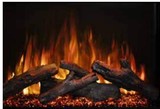
Orange Flames - Logs off