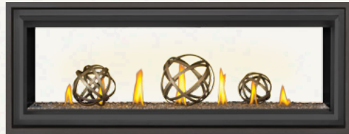
Vector™ 50 - Black Premium Safety Barrier and 1" Black Finishing Trim