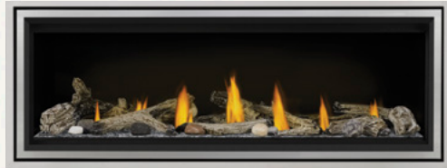
Vector™ 50 - Stainless Steel Premium Safety Barrier and 1" Stainless Steel Finishing Trim