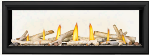
Vector™ 50 - Black Premium Safety Barrier