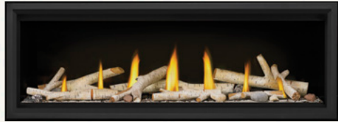
Vector™ 50 - Black Premium Safety Barrier