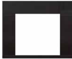
RBF24TRIM40 - 40" Black Installation Trim