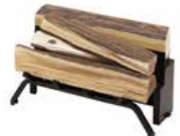
RBF24FC - Fresh Cut Log Set Dimensions: 18-1/2" W x 10-7/8" H x 11" D (46.8 cm x 27.4 cm x 27.9 cm)