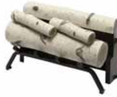
RBF24BR - Birch Log Set Dimensions: 18-1/2" W x 10-7/8" H x 11" D (46.8 cm x 27.4 cm x 27.9 cm)