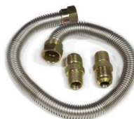
Flex line & Fittings