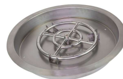
Burner & Pan Options