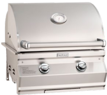
Choice Multi-User CM430i, 24" Built-In Grill CM430i-RT1N*