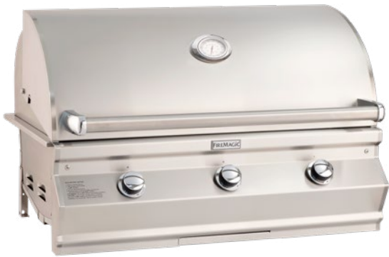
Choice Multi-User CM650i, 36" Built-In Grill CM650i-RT1N*