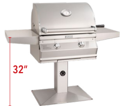
Choice Multi-User Accessible CMA430s, 24" Post Mount Grill CMA430s-RT1N*-P6 - Patio Post Mount (shown) CMA430s-RT1N*-G6 - In-Ground Post Mount