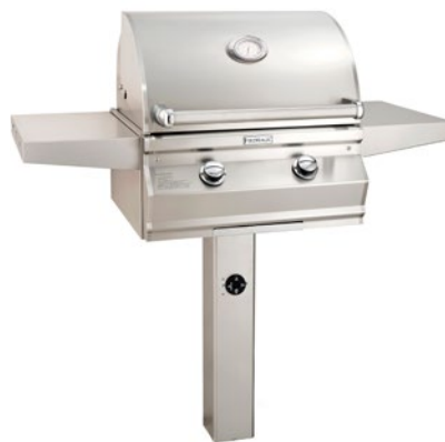
Choice Multi-User CM430s, 24" Post Mount Grill CM430s-RT1N*-P6 - Patio Post Mount CM430s-RT1N*-G6 - In-Ground Post Mount (shown)