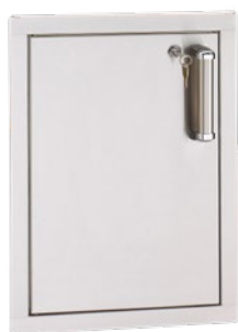
Model Shown: 53920KSC-L

Keep your BBQ tools and supplies secure with new Fire Magic storage doors equipped with lock and key.