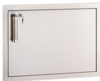
Model Shown: 53917KSC-R