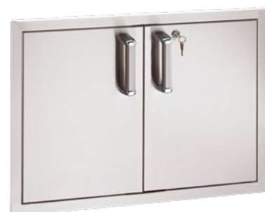
Model Shown: 53930KSC