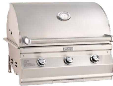
Choice Multi-User CM540i, 30" Built-In Grill CM540i-RT1N*